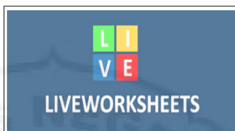
Figure 1.2 Liveworksheet

By seeing and knowing the issues happen, the researcher present liveworksheet as an online worksheet. Digital worksheets are an innovation based on printed spreadsheets converted into digital or electronic form using technology. Students' worksheets are used to help the students and allow them to interact with the material provided. By using liveworksheet , the students can finish the questions and send their answer to their teacher. Furthermore, the teacher can also see the students' score directly.