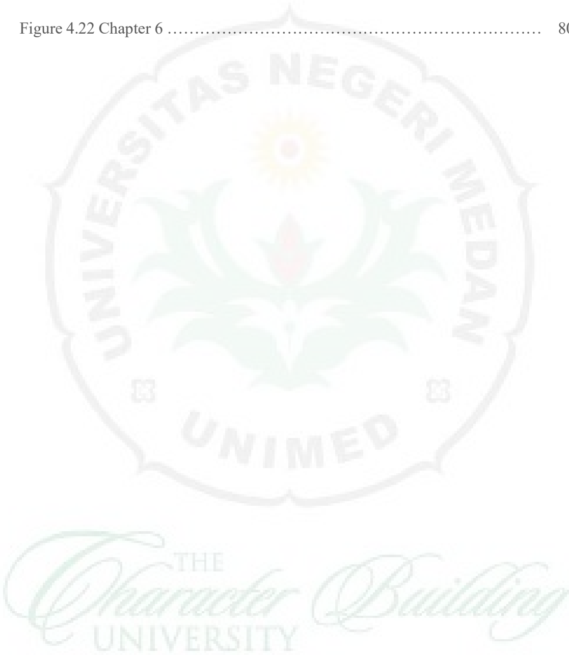
Figure 4.22 Chapter 6 ..... 80