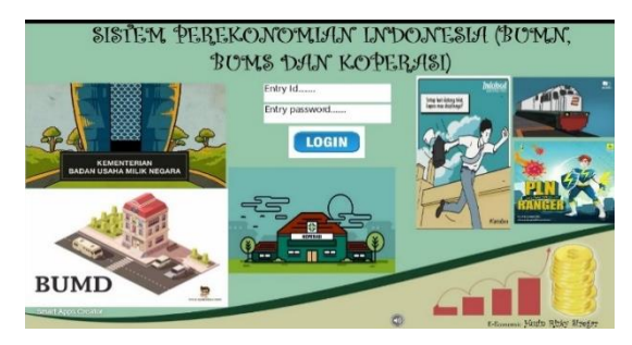
Fig. 1. Mobile Learning . with login and password display

The results of the application design that have been made on the smart apps creator will be displayed on the android program, so that it becomes a learning media product based on Mobile Learning . with login and password display.