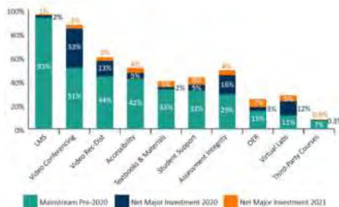
Figure 1. The use of technology in education Pre-2020, 2020 and 2021.

Today, technology is developing rapidly. This is in line with the need for technology in human life. Its development has penetrated all aspects of human life, for example in economic, political and cultural aspects. It is also inevitable in the aspect of education. Where thanks to technology, aspects of education have progressed very rapidly. With technology, the implementation of learning becomes more effective and efficient and the implementation of this education is not limited by space and time (Noriska, 2021). Furthermore, Kelly (2021) stated that there was an increase in the use of technology. The Changing Landscape of Online Education (CHLOE) 2021 Survey which is a survey institution in higher education in the United States which is carried out every year that discusses online learning in terms of structure and organization. The institute found that there had been very different changes in the use of technology in education in 2021 compared to 2019.