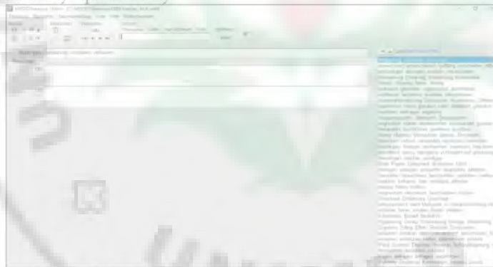
Figure 2. Searching in the Thesaurus MIDOS6 Software