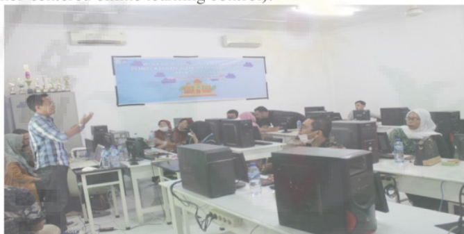
Figure 2. Workshop on Using the GL 4.0 Platform

registration, fill in the student's profile completely and then ask the class code from the subject teacher to become a user . Then pay attention, listen and click on every command on the platform. Students are asked to provide responses or responses from each session either through typing on the platform but can also provide feedback in offline sessions (face to face in class). The android-based platform is presented with rigidity and regularity, meaning that students cannot skip or skip views, or duplicate smartphone screens. This application was created so that it cannot be duplicated or ignored by opening other applications when the operation of the GI 4.0 application is in progress but it is done by students so they have to start from the beginning, in that situation the teacher can see the history of student learning activities (teacher-centered online learning control).