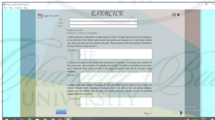
Fig. 5. The assignments or exercise design template