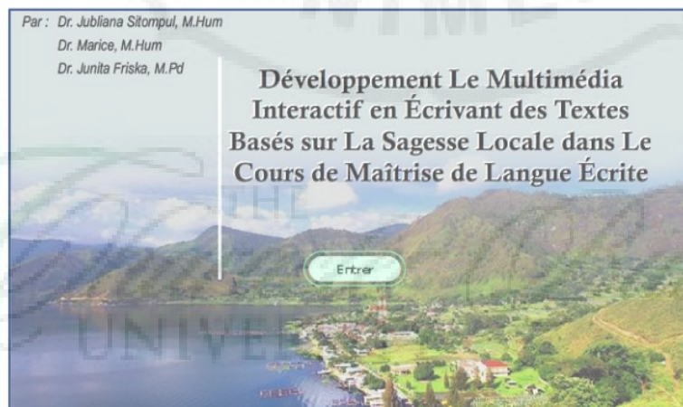
Fig. 2. The design template for the opening screen

In the aspect of the learning quality for the learning media in the MDLE course, the average percentage was 86,5% and categorized as very good. There were nine indicators of this aspect, such as 1) Giving learning opportunity, 2) Giving help to learn, 2) Motivating quality, 4) Learning Flexibility, 5) The relation between this learning program and others, 6) The social interaction quality during the learning process, 7) Test and scoring quality, 8) able to give impact to the students, and 9) able to provide impact for lecturers and the lecturing process.