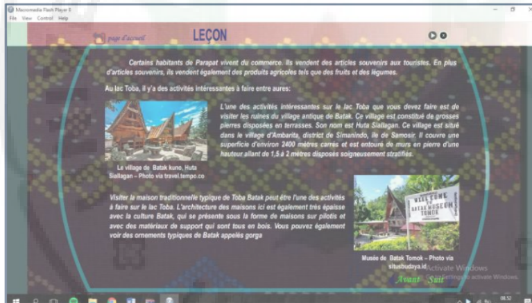
Fig. 4. The design template for the materials equipped with pictures section