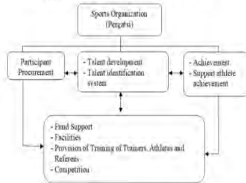
Figure 1: Sports Coaching Scheme

The sports coaching scheme is as follows: