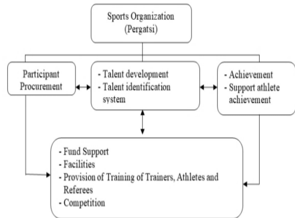
Figure 1: Sports Coaching Scheme

The sports coaching scheme is as follows: