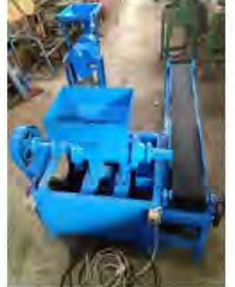
Fig. 2. Wood charcoal sawdust charcoal briquette molding machine.