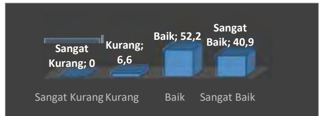
Fig. 1. Student Condition