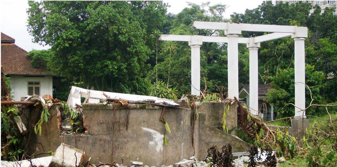
Figure 2. Twin Villa's on Imam Bonjol Road, demolished in 2009

This bridge is a place to relax for planters, administrators, or guests. A term arises from this habit, namely, eat wind ( makan angin ). In the middle of the city hall triangle, the post office and Hotel De Boer stand the Nienhuijs Monument in the form of a fountain. This monument is the zero point in the city. From the heart of the developing city of settlements such as Kesawan called Chinese settlement ( Chinesewijk ), Polonia as European settlement ( Europeanwijk ), Madras, or little India as Indian settlement ( Indianwijk ), Kota Maksu as native settlement ( Inlanderswijk ) for Malays.