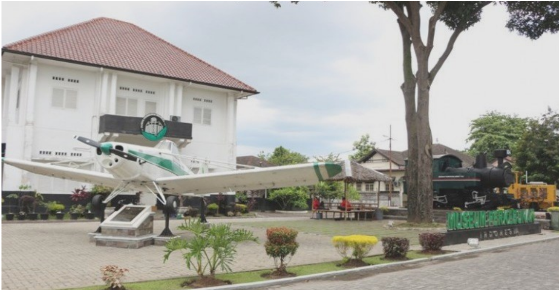
Figure 3. Utilization of Heritage Buildings into the Indonesian Plantation Museum