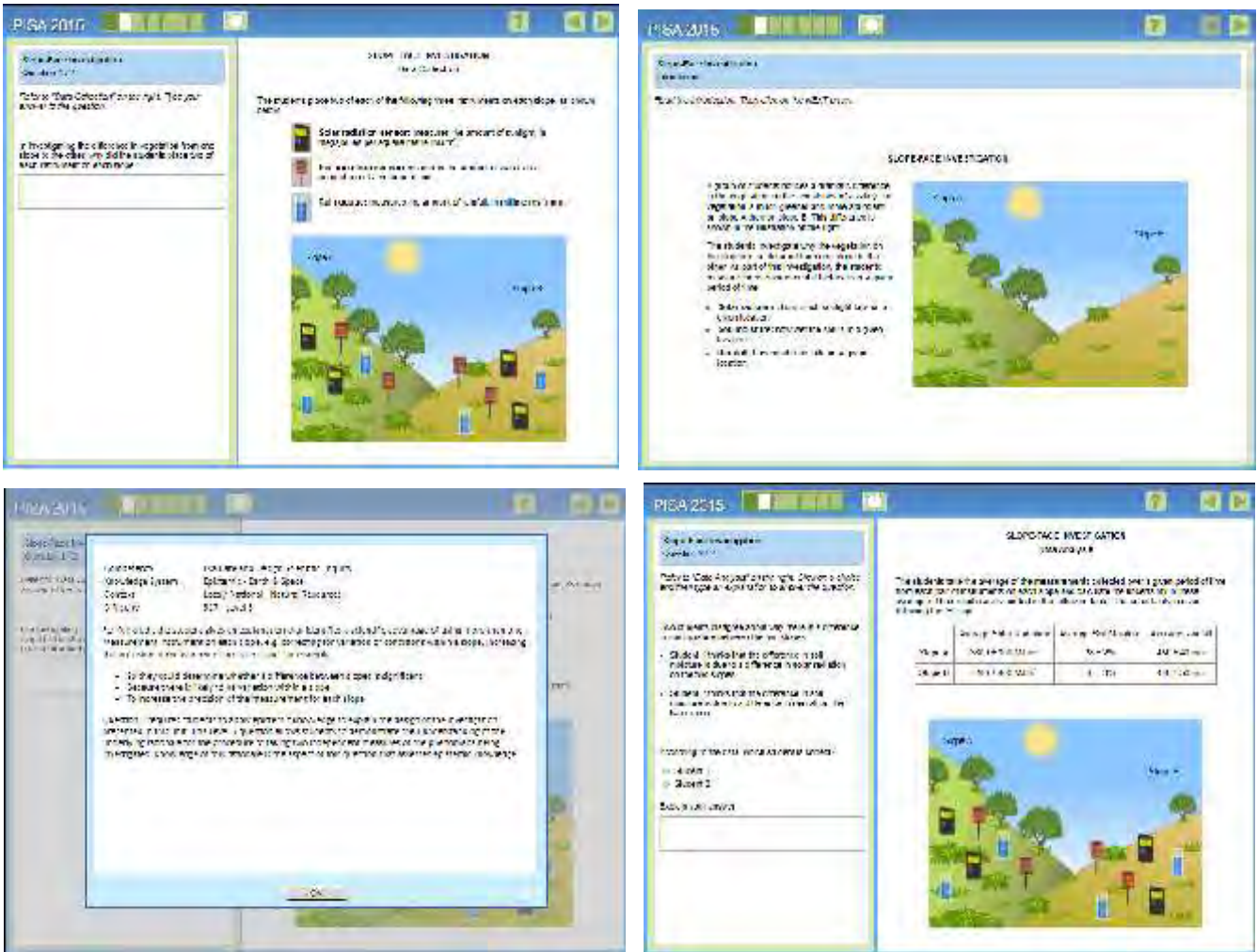
Fig. 2. Try out a selection of PISA 2015 science questions. Have a go at answering PISA 2015 questions to discover their level of difficulty and the concepts being tested.