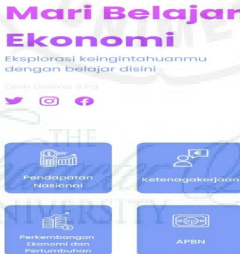
Figure 3. The first page in mobile form