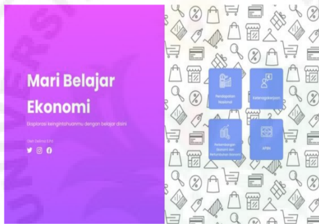
Figure 2. The cover of E-Modul

The development of the initial form of the product, namely developing the initial form of the product to be produced. At this stage, supporting resources are collected in developing interactive teaching material products in the form of software, learning resources, and facilities and infrastructure. The process starts from identifying the syllabus in the form of competency standards and essential competencies according to the needs analysis during initial observations and interviews with subject teachers and students. After determining the competency and competency standards, then proceed with implementing a learning implementation plan (RPP). The lesson plans developed to use the assignment method, where this interactive teaching material will be used independently by students. The following is the design of the first page of the e-module being developed.