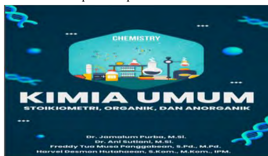
Figure 2. E-Learning-Based General Chemistry Book

The product developed in this study is e-learning on computer-based test (CBT) General Chemistry learning organic material. CBT-based e-learning is prepared and developed with the aim of facilitating lecturers and students in the learning process of General Chemistry on organic matter and is expected to assist lecturers in conducting diagnostic tests and in making academic policies for students. The products produced and have been declared feasible by expert validators are then applied to students to analyze the effectiveness of the products produced.