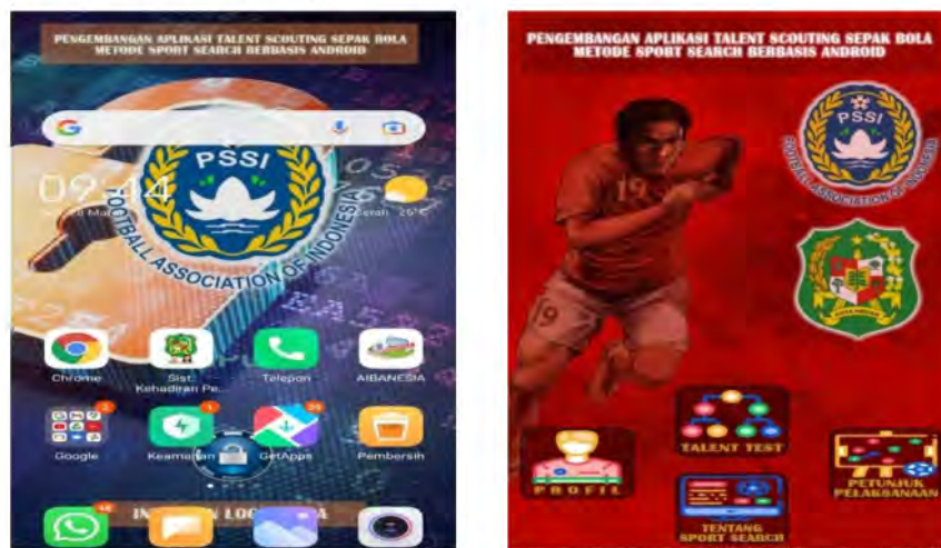
Fig 2. Display

The development of a product called AIBANESIA (Indonesian Talent Identification Application) based on Android as a tool for making product media. The following is a product display that researchers have successfully developed