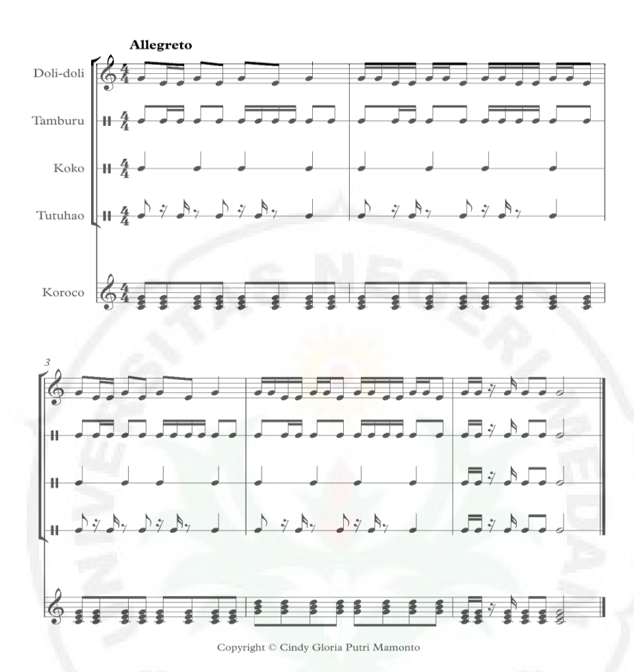
Figure 2. Ensemble of Moroi ba Aekhula