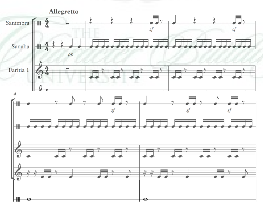
Figure 3. Mamözi Göndra Ensemble