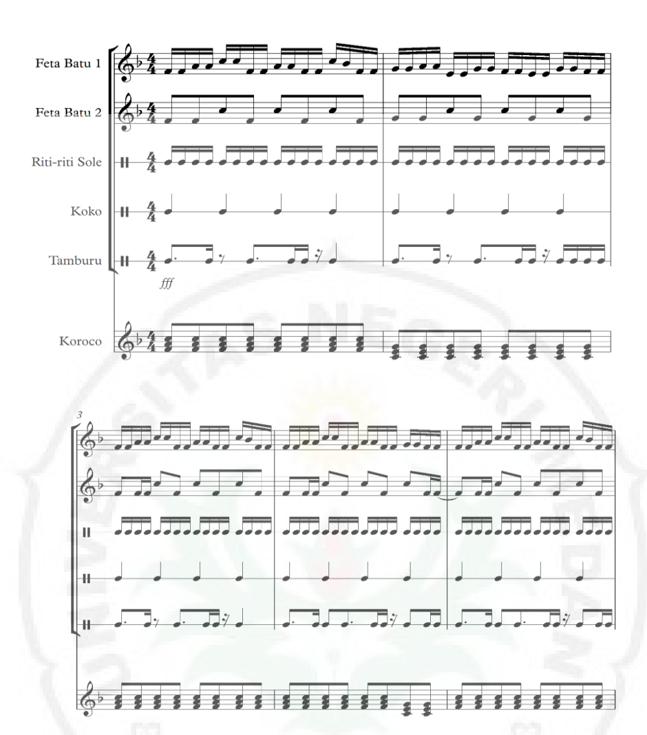
Figure 4. Feta Batu Ensemble