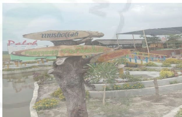
Figure 3. Directions for visitors (Amelia, 2020)

In addition to supporting facilities, at the Paloh Naga traditional market there are also supporting facilities (Sunaryo, 2013: 138). One of the supporting facilities is a signpost. Directional signs serve to make it easier for visitors to find things such as prayer rooms and toilets in the traditional Paloh Naga market.