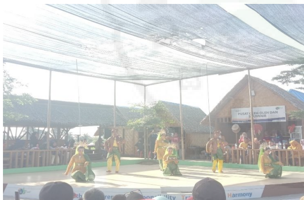
Figure 2. A special dance to welcome visitors (Amelia, 2020)

Utilization of open space in the traditional Paloh Naga market. The open space in the traditional market is in the form of an open stage, which is used to entertain visitors on Sunday mornings. One of the treats displayed was a traditional dance to introduce local culture (Banio & Malchrowicz-Moško, 2019), as the dancers came from the upbringing of the village of Denai Lama, namely the Sanggar Lingkar.