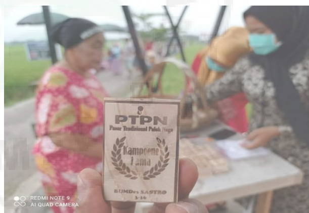
Figure 1 Traditional Paloh Naga market (Amelia, 2020).

The second purpose of the Paloh Naga traditional market is to preserve snacks so they don't become extinct and as a presentation to introduce Paloh Naga agro-tourism, which is located in the same place (Lee, 2018). This is also in line with research conducted (Isnaini, 2019), which says the Kotagede keroncong market is a form of preservation of Kotagede traditional snacks, filled by local residents who sell traditional snacks by adding merchandise stands. The choice of types of food at the Paloh Naga traditional market is more inclined towards Javanese food than Malay specialties, namely because the majority of the tribes in Denai Lama Village are Javanese. The manager of Denai Lama village, one of the tourist villages in Deli Serdang Regency, developed this Paloh Naga traditional market as a development of agro-tourism, which is the reason why they opened the Paloh Naga traditional market.