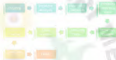
Figure 1 Research Flowchart.

To achieve the expected objectives, this type of research was designed using a descriptive qualitative approach to obtain the portrait of Center of Laboratory Project (CoLaP) needs analysis in learning. The design of CoLaP analysis in learning is as follows: