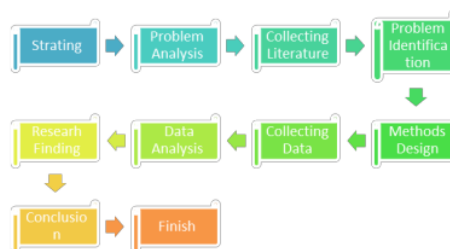
Figure 1 Research Flowchart.

To achieve the expected objectives, this type of research was designed using a descriptive qualitative approach to obtain the portrait of Center of Laboratory Project (CoLaP) needs analysis in learning. The design of CoLaP analysis in learning is as follows: