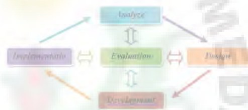
Figure 2 – ADDIE Model Stage.

The research method used is the ADDIE model development method (Analysis, Design, Develop, Implement, and Evaluate) developed by Reiser and Mollenda. In this ADDIE development design model, there are five stages of research implementation, namely as follows: