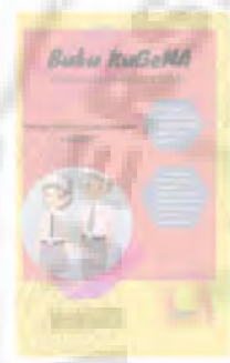
4 Figure 5. Cover before Revision

After being given input, the cover was changed according to the reviewer's request, which is to complete the cover with the entire conspicuous core of this book. The goal is for readers to know what is in the book and what makes it different from other books. Here the cover fixes by adding to bring up complete sentences with Assessment.