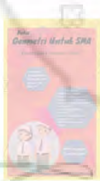
Figure 6. Cover after Revision