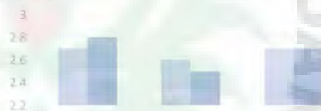
Figure 3. Stage 1 Media Expert Validation Results

Furthermore, in addition to the input, validation questionnaires were also given to the validators. The results can be seen as follows.