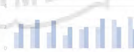
Figure 4. Stage 1 Material Expert Validation Results

Based on the table and graph above, the highest score is 2.8 with proper criteria. However, it is still in the revision stage until it gets a very decent score.