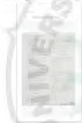
Figure 1 – Printed Books photographed and uploaded on GCR.

the same textbook as the teacher, students find this learning very boring. Because students do not feel they accept something new if only the same material they have is given back to them. Conventional books (printed books) will not be read if there is no assignment. Therefore, the learning independence of students with situations like this is very low. Student interest in learning is very minimal. Play is the main choice for students. The following is an example of teaching materials shared by teachers in Google Classroom.