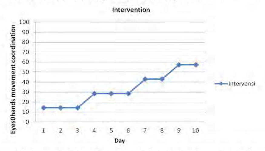
Figure 2. The Graphic of The Ability to Coordinate Eyes and Hand Movements in The Intervention Condition

Based on the data, the sample is experiencing well transformations. It means that there are eyes and hands movement coordination developments. In the ninth and tenth meetings, the child has got better in movement coordination skills. The data is shown in a graphic below for a clearer explanation: