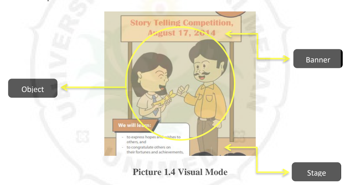
Each of those elements has its respective roles in creating meaning. However, to find out its role it cannot be seen at a glance. The analysis is needed by using theories from experts such as Halliday's Systemic Functional Grammar and The Reading Images by Kress and Van Leeuwen. In these theories, it is discuss how language is divided into several metafunctions and treat images as language.

The third is visual mode. This mode can be seen through the illustration layout. Such as the layout of objects in the illustrations used. In this illustration, it can be seen that the position of the object is in the middle, namely two people facing each other, there is a banner placed behind the object, and there is a stage that is placed below as if it were a foothold of the main object. The mode can be seen in picture 1.4.