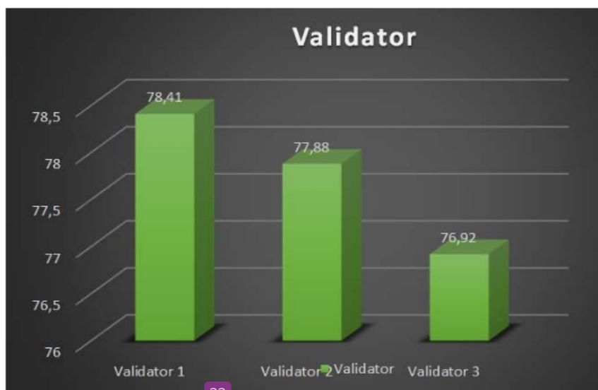
33 Figure 1. Diagram of the Results of the Validation of Teaching Materials

23 To see the value of the results of the validation of teaching materials clearly, it can be seen in the following diagram: