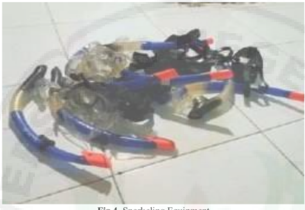
Fig 4. Snorkeling Equipment

Figure 4 above shows a number of snorkeling equipment, some of which are in poor condition. The color is worn and rubber equipment that is damaged is only replaced using ordinary rubber. This snorkeling equipment is rented by a travel agent if there are visitors who use tour packages to visit Pamutusan Snorkeling equipment provided by travel agents is not proportional to the number of visitors there. As a result the use of snorkeling equipment must be used interchangeably. This is not in accordance with the expectations of visitors, even though visitors have incurred a large enough cost to be able to travel to the island. Problems such as those described above a very hindering for the development of tourist attractions as stated by Suwantoro [1]: "The main elements that must receive attention in order to support the development of tourism in tourist destinations, include: (1) Tourism Objects and Attractions (ODTW), (2) Tourism Infrastructure, (3) Tourism Facilities, (4) Governance (services, security, and comfort) (5) Community / Environment ".