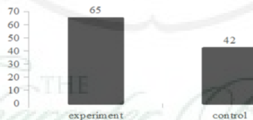
Figure 2: N-gain improvement in English skills of experimental and control classes

The average value of English language skills in the pretest is almost as large as the average post-test, shown in Table 3. An increasing percentage of N-gain English skills of both classes are shown in each of the medium categories. The percentage increase in N-gain of English language skills of the two classes can be further broken down based on its elements, namely: reading, listening, writing, and speaking which are depicted in Table 3 and Figure 3.