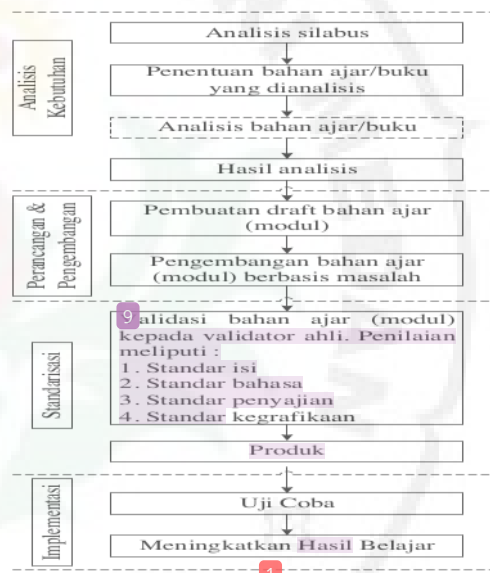
Fig. 1. The research procedure of problem-based module development on alkenes and alkynes material.

The procedures of this study were conducted following a research procedure that had been done by previous researchers Sunaringtyas [11]. It consisted of several stages, including: (1) analyzing the chemistry books of alkenes and alkynes materials commonly used in senior high schools; (2) designing and developing module based on the alkenes and alkynes materials; (3) standardization of developed module; (4) test module that had been developed. Research procedures are briefly described in Figure 1.