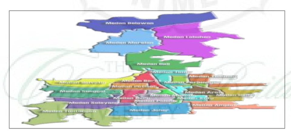
Figure 1. Medan City Map

Medan City is a municipality located in North Sumatra Province with an area of 265.1 km2 (10,240 sq mi) consisting of 21 subistricts. The population is 2,212,053 people consisting of 1,049,457 men and 1,071,596 women (https://tumoutounews.com/2018/12/05/j NUMBER-penduduk-sumatera-utara-tahun-2018/)