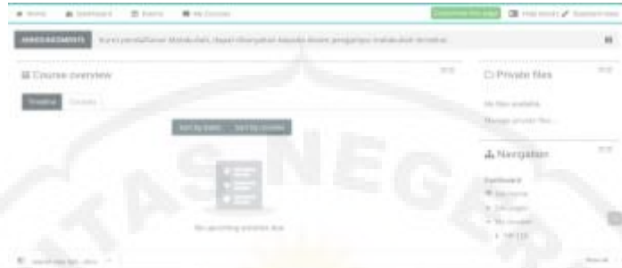
Figure 1. The displays of a sports learning website

Validation of the feasibility of learning products that have been made will then be validated first. Validation is an activity to assess learning media that has been made before the media is tested on respondents. Limited product trials The effectiveness of the developed model is seen in the results of product trials conducted by researchers on students in the Sports Coaching Education Study Program, Bhayangkara University, Jakarta Raya. The limited group trial consisted of 30 students from 1 class who were in the 5th semester with a statement instrument sheet consisting of 3 aspects of assessment, namely the usability dimension, the information quality dimension and the service interaction dimension learning design. a limited number of developed media.