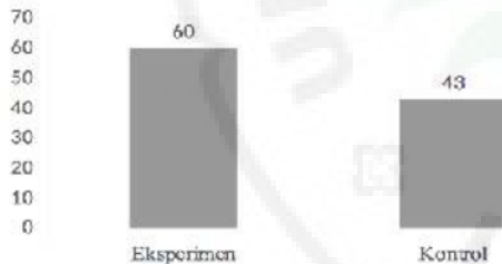
Fig 2. Percentage of Increase in N-gain of Both Classes Learning Pretest and posttest data analysis using different test (t-test) with the condition that the data is normally distributed and homogeneous. Data normality test uses Lilliefors test and homogeneity test uses variance test. Calculation of normality, homogeneity and difference tests using SPSS. The results of normality, homogeneity, and difference tests are shown in Table IV.

Based on Table 3 and Figure 1, it can be seen that the average value of the pretest learning outcomes of the two classes is almost the same while the average posttest of the two classes is different. Based on Figure 2, the percentage increase in N-gain learning outcomes of the experimental class by 60%, and the control class 43%, each in the medium category. It can be concluded that with the application of ICT-based learning learning, student learning outcomes in English are better when compared to conventional learning.