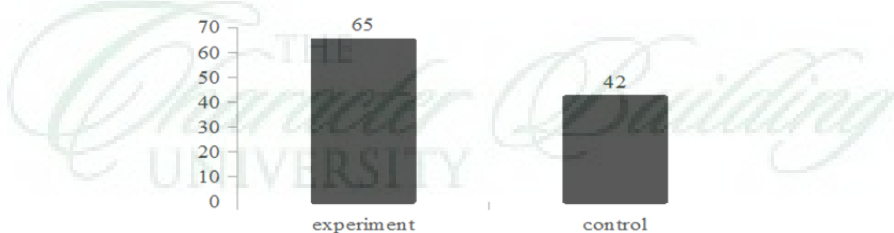
Figure 2: N-gain improvement in English skills of experimental and control classes

The average value of English language skills in the pretest is almost as large as the average post-test, shown in Table 3. An increasing percentage of N-gain English skills of both classes are shown in each of the medium categories. The percentage increase in N-gain of English language skills of the two classes can be further broken down based on its elements, namely: reading, listening, writing, and speaking which are depicted in Table 3 and Figure 3.