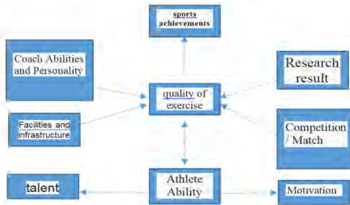
4 Figure 1. Factors Affecting Exercise Quality