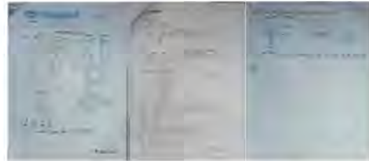
Figure 6. Results Answer Student S-8

Subject to the student code S-8 and S-26 is a subject that has a low spatial ability test results. Interview excerpt presented as follows. Working result matter by the students coded S-8 in Figure 6 as follows: