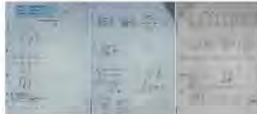
Figure 5. Results Answer Student S-22

From the results of an interview on Question 2, I found that the way of thinking of S-15 and S-22 there is a difference, where students S-15 in the counting was not smart enough while students S-22, still no effort to be able to resolve the issue though constrained because of time. Both students can understand a problem and connect it to the surrounding objects that are used as a tool. Only S-22 students need the help of friends. Also, both can analyze a wake room if the room woke played with 90^\circ and can be positioned wake of a room at a different angle after the swivel 90^\circ . Working result matter by the students coded S-22, in Figure 5 as follows: