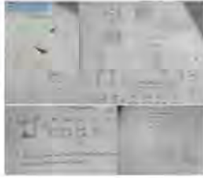
Figure 2. Results Answer Student S-4

Working result matter by the students coded S-4 as follows in Figure 2 below: