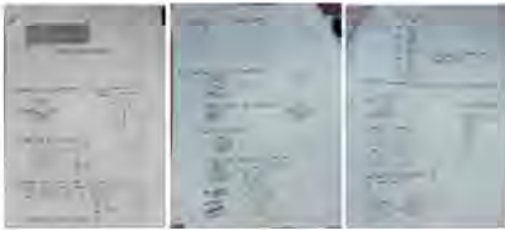
Figure 3. Results Answer Student S-29

From the results of an interview on Question 1, I found that the way to think S-4 and S-29, the same is to understand the problem and connect it to the surrounding objects that are used as a tool. Only students S-29 requires a fair amount of time compared to students S-4 in analyzing a wake room if the room got up and played back to 270^\circ can be positioned wake of a room a different angle on the play after 270^\circ . Working result about the S-29 students coded as follows in Figure 3 below: