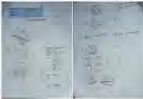
Figure 7. Results Answer Student S-26

From the results of an interview on Question 3, the S-26 students where students S-26 also was able to visualize the image of the form webs into a box shape that is perfect as S-8 students. Also, the S-26 students can determine the position of each side of the box from a different part of both front, rear, right, left, up and down. Only on the spatial relationship of S-26 students can not solve the problem because there is pretty good at counting but still no attempt to resolve the problem by considering the way of solving the same problem. Students S-26 is not at all good at dreaming up a position wake the room if the room woke played with 360^{\circ} , 270^{\circ} and 90^{\circ} different thing with S-8 students who still can fantasize geometrical position if played 360^{\circ} . Working result matter by the students coded S-26, in Figure 7 as follows: