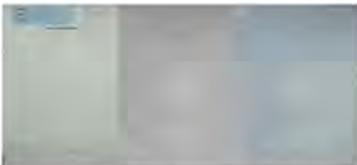
Figure 4. Results Answer Student S-15

The working result about the S-15 students coded as follows in Figure 4 below: