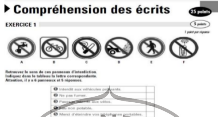
Figure 3. form of items