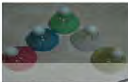
Fig.3. Ball.