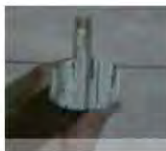
Fig.1. Paddle.

In addition to the length and thickness of the paddle, this paddle is able to withstand a maximum load of 10 kg and weighs 250 grams.