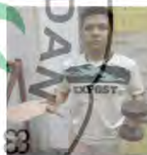
Fig. 2. Paddle load test.