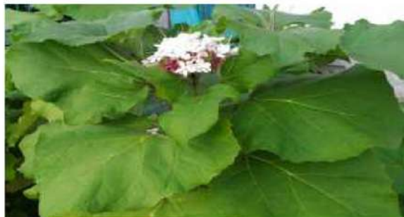
Fig.-1: Sarang banua ( Clerodendrum fragrans Vent Willd).

respectively 5 could be used as the extraction solvents. Selection of the solvent in the maceration process is based on the principle of “likes dissolve likes” solubility, meaning that the polar compound only dissolves in polar solvents, and vice versa for semi polar and non-polar compounds.