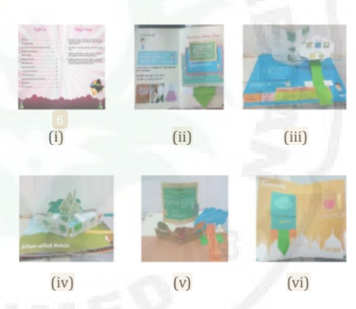
Figure 1. Developed Innovative Pop-up Book: (i) Table of content, (ii) page of colloidal definition, (iii) page of the colloidal types, (iv) page of colloidal properties, (v) the role of colloids page, and (vi) the conclusion page

c) The development of assessment instruments. The validation of pop-up book was assessed using questionnaire sheet and the students' activities were assessed using observation form. d) Validation of popup book. Validation aimed to assess the feasibility of the pop-up book. The feasibility of pop-up book on colloids material obtained from the expert validators. Based on the results