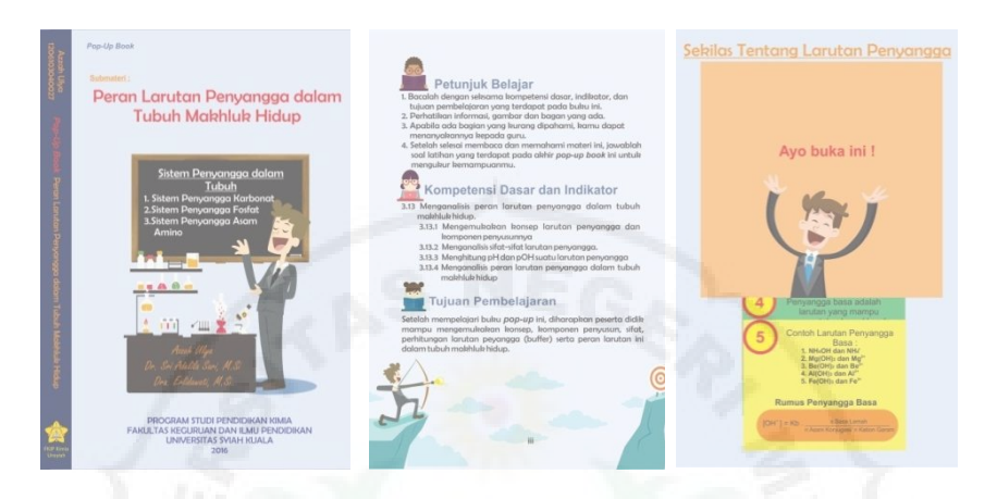
Figure 1. The Design of Pop Up Book