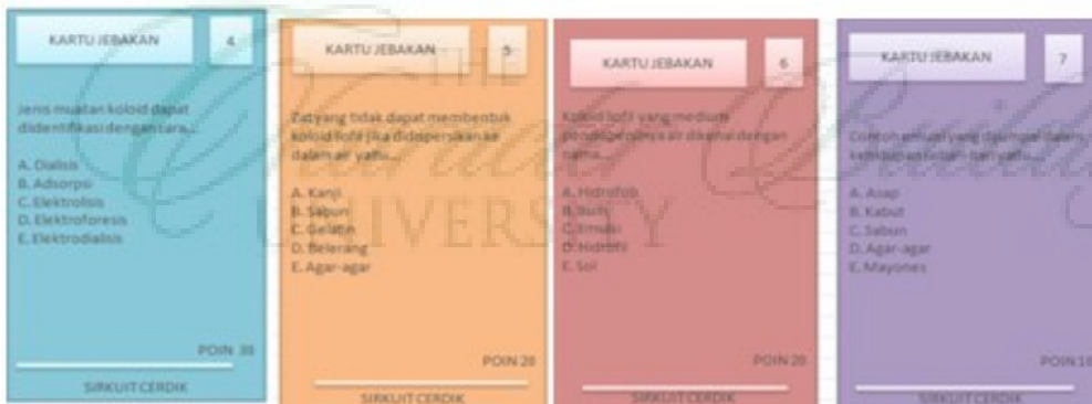
Figure 3. Trap Cards

Trap card was a replacement of the card, where tricky question was taken at one point stopping place or the ground was already owned by another group. This card was designed to add excitement to the game, so the game was not too monotonous. This card was consisted of 15 pieces of cards and shown in Fig. 4.