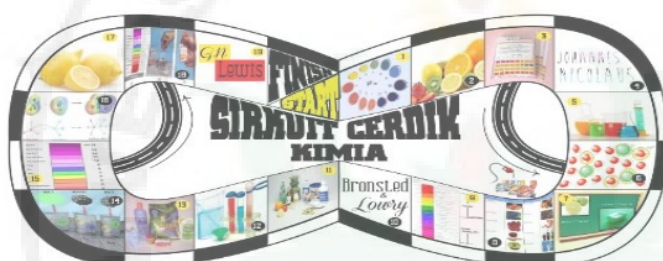
Figure 1. The preliminary design of ingenious circuit board game.

Design Phase. At this stage, the design of the product was made, the product produced in the form of chemical instructional ingenious circuit of colloids. Colloidal material was one of learning materials chemistry at the high school level classes XI 2 nd semester circuits Games ingenious in design by modifying the monopoly and snakes and ladders game that we had been know daily life. This learning media was designed so that attract students to enjoyable learning. At this stage, designed some of the components required in the learning media such as media board, pawns to play, and a set of game cards (card proprietary questions, trap cards and card points). The preliminary design of ingenious circuit board games can be seen in Fig.1.