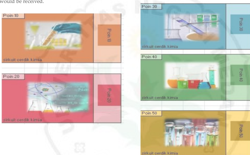
Figure 5. Point Cards

The point cards as shown in Fig. 5 were the cards which replacement of fake money as commonly found in a monopoly game. In addition the point cards would be get when students were able to answer the questions from the question cards and trap cards. When the student had passed the star box, the point cards would be received.