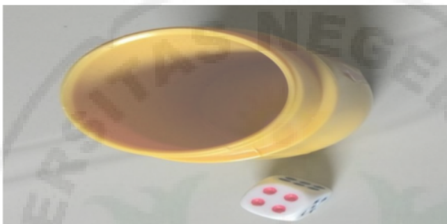
Figure 5. Dice and Shuffle

This game provided 1 (one) dice and 1 (one) shuffle. The dice were slightly larger than the dice which used in monopoly game. Fig. 7 shows dice and shuffle used to play.