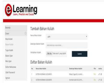
b. Menu of Material Subject