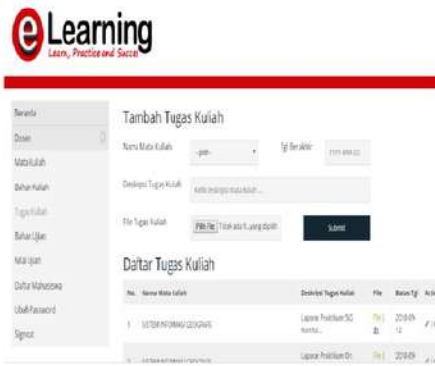
c. Menu of Lecture Task