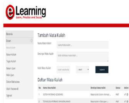
a. Menu of Lecture

The product development carried out was the development of m-Learning media as a blended in learning. This stage is after the needs analysis. The product development process is carried out in several stages, namely collecting materials in the form of materials from valid sources and making material presentations and material mastery test questions. The M-Learning consists of a summary of the subject matter and enrichment that is equipped with competency standards, basic competencies, indicators, learning objectives, relevant learning videos, sample questions, practice questions, and competency tests to measure student success. M-Learning is made so that students are more interested and easy in learning material. Mobile learning products are built to strengthen learning. Mobile learning products that have been developed can be seen as in Figure 1.