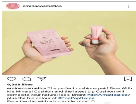
TABLE 1. TYPES OF MODALITY USED IN BEAUTY PRODUCT ADVERTISEMENTS ON INSTAGRAM CAPTION