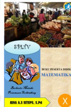
Fig.1. . Display of Student Book Cover

The cover section is designed in a way that reflects the contents of the book, or in other words is a general snapshot of what is contained within the SB. The design is expected to give students an idea of what will be learned. The design of the SB cover can be seen in Figure 1.