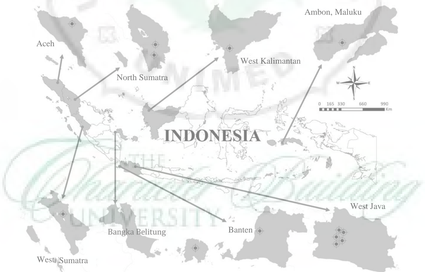
Figure 1. Location of Bouea sampling in Indonesia

Samples of B. macrophylla and B. oppositifolia were obtained from various regions in Indonesia representing 7 analyzed regions, namely Ambon, Banten, Aceh, West Sumatra, West Kalimantan, Bangka-Belitung, North Sumatra, and the accession of the Bogor Botanical Gardens (Figure 1). Samples were in the form of a fresh leaf with Mangifera indica and Anacardium occidentale as outgroup. The accession of genus Bouea is presented in Table 1.