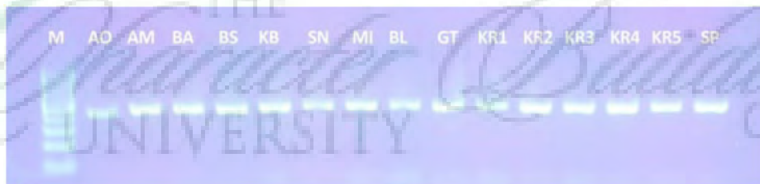
Figure 2. Visualization of PCR products by 1% agarose; AO = A. occidentale , AM = Ambon ( B. macrophylla ), BA = Banten ( B. macrophylla ), BS = stone cage, West Sumatra ( B. macrophylla ), KB = Kalimantan Barat ( B. macrophylla ), SN = Lhoksukon, Aceh ( B. macrophylla ), MI = Mangifera indica , BL = Bangka Belitung ( B. oppositifolia ), GT = Gunung Tua, North Sumatra ( B. oppositifolia ), KR1, KR2, KR3, and KR5 = Bogor Botanical Gardens ( B. oppositifolia ), KR4 = Bogor Botanical Gardens ( B. macrophylla ), SP = Sipiongot, North Sumatra ( B. oppositifolia )

A total of 6 accessions of B. macrophylla and 7 accessions of B. oppositifolia together formed two main branches and were not clustered geographically. Analysis of phylogenetic tree based on the sequences trnL-F showed that B. oppositifolia was not derived from a common ancestor of the area. The apportionment pattern at various places could explain that genus Bouea was a native plant in western Indonesia. The absence of relationship among them was possible because their growing environment was isolated, and this state was associated with genetic factors that lead to the distance relationship. On the other hand, B. macrophylla going into single clad showed a high relationship among their members. This can be explained that B. macrophylla came from one of the branches derived from B. oppositifolia . In this case, B. macrophylla was a form of cultivation. This was also supported by morphological characters possessed by B. macrophylla such as fruit size, bigger leaf size and brighter colors that were superior in a character of cultivation.