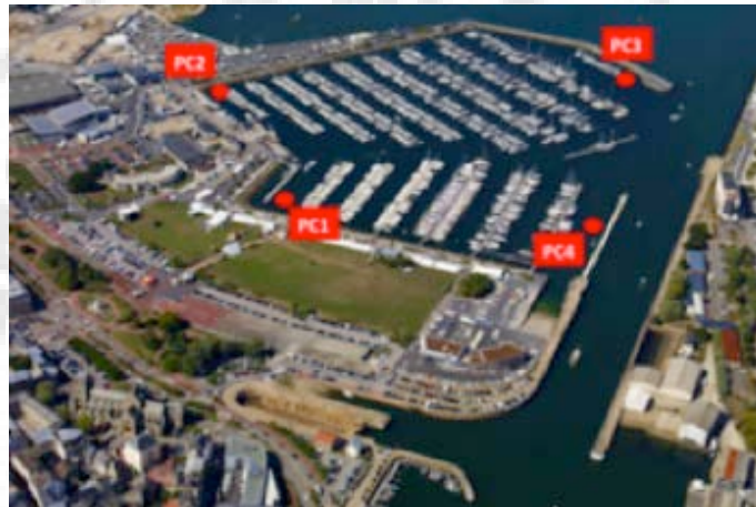
Figure 1: Sampling locations on Port of Cherbourg

heavy metal content. After being dredged the sediment will be disposed in a designed area to prevent the micro pollutant dispersed in surrounding environment. The hydraulic binders (cement and lime) utilized in this paper are the common binders used in soil stabilization work. The Pozzolanic binder used in this study is fly ash. Two types of fly ash are used; namely Sode and Sop are a waste from by product from two local mining. This means that initial characteristic of Sode and Sop is different. These two type of fly ashes (Sode and Sop) is pure waste, its have never been treated by any treatment, the idea is to treat waste with a waste, to maximize the reutilization of waste material.