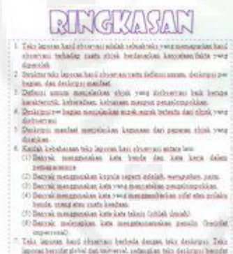
Figure 4. Summary

The summary is displayed at the end of the learning activity. This summary contains the essence of the material presented in the activity of one to three activities. This summary helps students understand the material quickly.