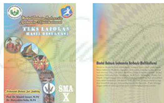
Figure 2. Front Cover and Back Cover

The front cover contains the title of the module, the author's identity, the identity of the supervisor and the subject matter. The cover of the module is also equipped with 2 logos, i.e. logos graduate school of the State University of Medan (Unimed) and 2013 Curriculum logo. The front cover of the module is also equipped with a range of images that represent the culture particularly Sumatera Utara (Mandailing, Karo, Malay, Simalungun, Batak Toba and Pakpak).