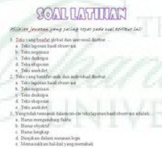
Figure 5. Exercise

A matter of practice located at the end of the learning activity after the summary. This question aimed to see the student's mastery to the materials presented. The question exercise made in the form of multiple choice test which consists of 20 questions.