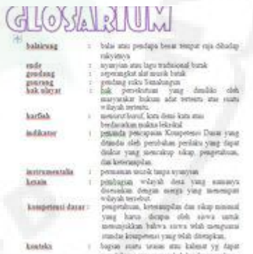
Figure 7. Glossary

Glossary aims to make it easier for students to understand the vocabulary is difficult. Module-based multicultural is certainly a lot to use vocabulary related to culture. So that students understand the meaning of the vocabulary. Therefore, if students find difficult vocabulary can directly see the glossary.