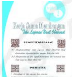
Figure 3. Module Learning Activities

Learning activity contains the title of the activity, the basic competence (KD) and indicators of learning. It is aimed to let the students know the basic competencies and indicators that will be achieved in the process of learning by using this module. In this module there are 3 learning activities designed 2 times for each learning activity.