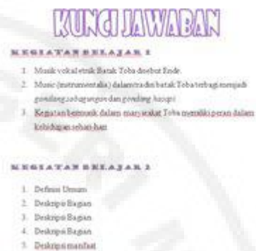
Figure 6. Answer Key

Answer keys are located after a matter of practice. This answer key starts from one to three activities as well as a matter of practice. Answer keys can be used by students to measure mastery of the material that has been studied.