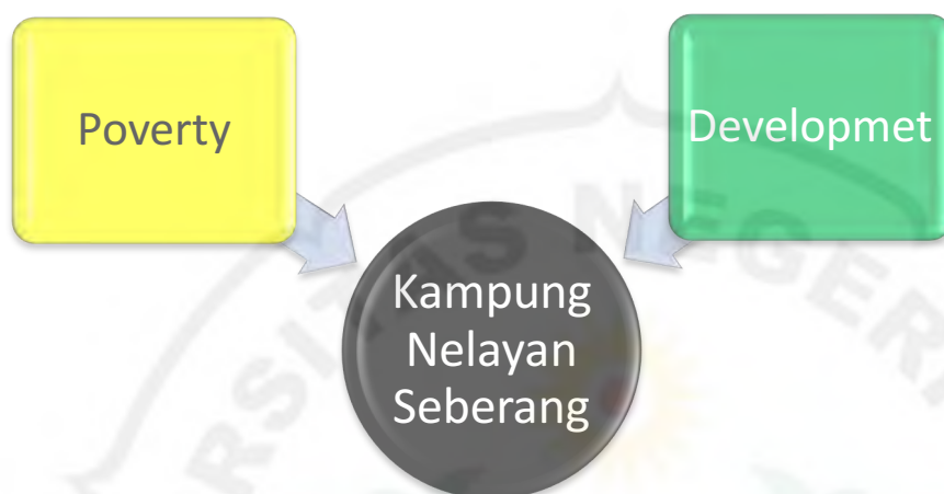
Figure.1 Dialectics of Poverty in Kampung Nelayan Seberang

Kampung Nelayan Seberang with all its population complexity is a product of poverty and development. This refers to the lasting form of poverty in the village. This condition is in line with the form of development that does not also provide welfare or at least remove the community from the deprivation.