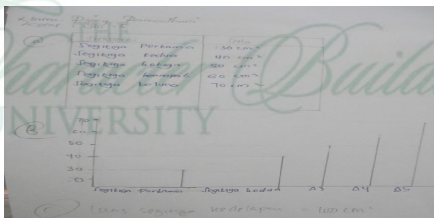
Figure 1.1 The results of students' answers