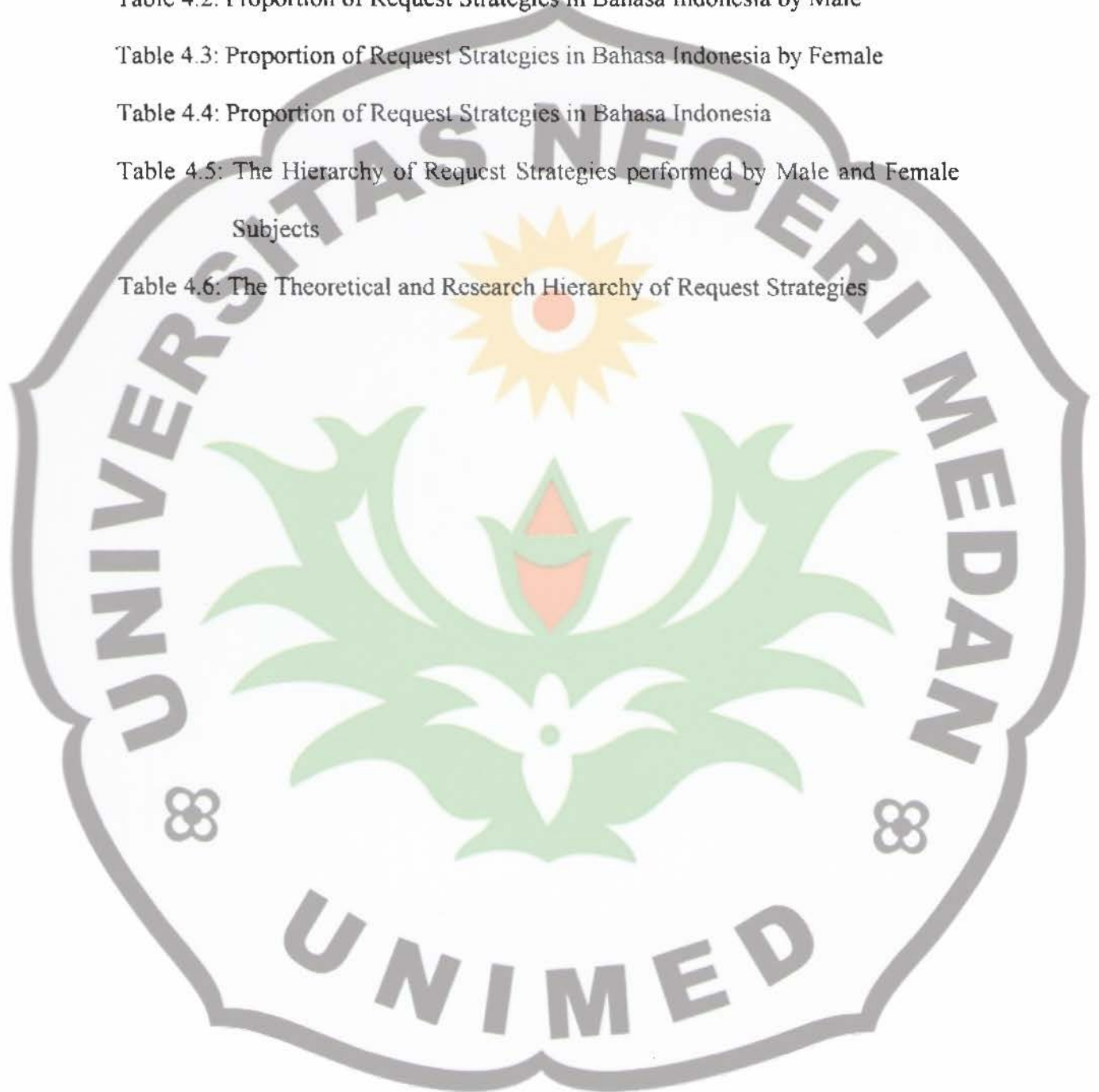
Table 4.6: The Theoretical and Research Hierarchy of Request Strategies

Table 4.5: The Hierarchy of Request Strategies performed by Male and Female Subjects