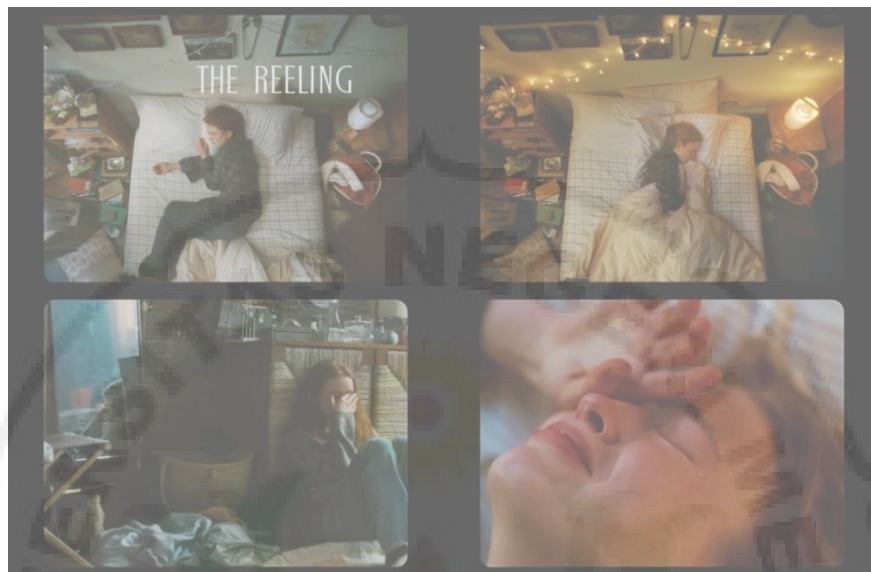
Scene 5 – The Reeling