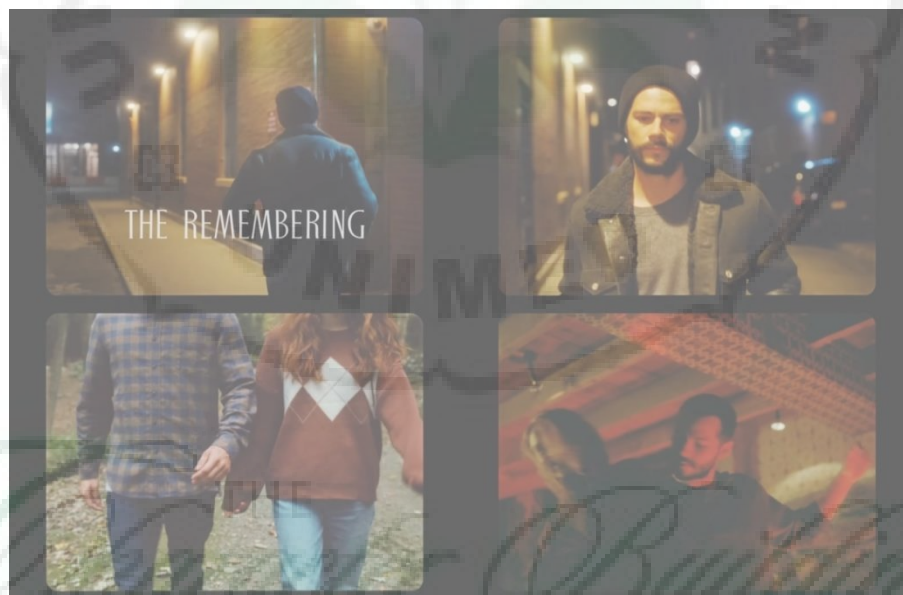
Scene 6 – The Remembering