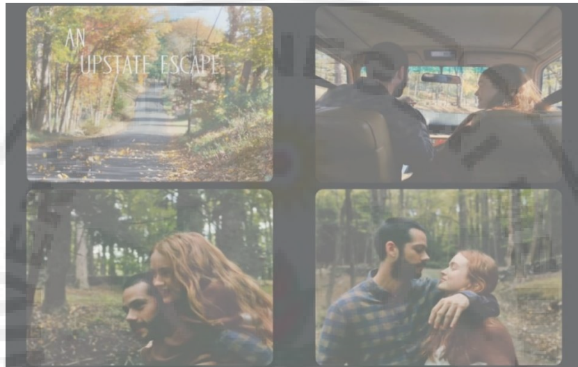
Scene 1 – An Upstate Escape