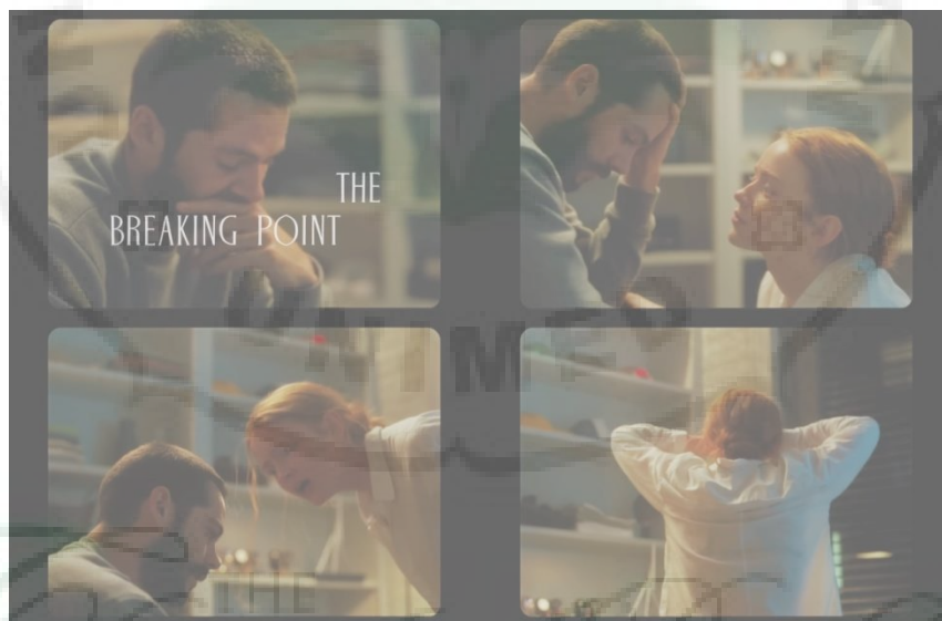
Scene 4 – The Breaking Point