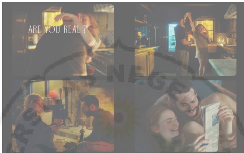
Scene 3 – Are You Real?