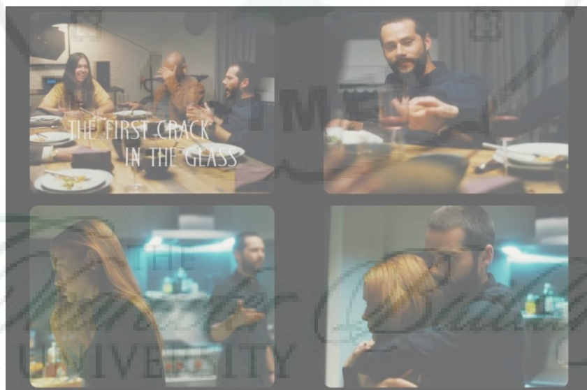
Scene 2 – The First Crack in the Glass