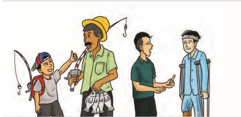
Picture 1.1 Sample of gender bias picture in textbook

In picture 1.1, the gender concept contained in the book is represented through pictures. In the picture there is a gender bias because the two illustrations are represented by only male. In the first illustration, there is a man who is fishing with his son. Where here fishing activity is represented through a man and his son even though it can be represented through a woman. Then, the second illustration in the picture is that there are two men where the other one is a patient. There is also a gender bias whereby the patient is represented by a man whereas the patient may be represented by a female.